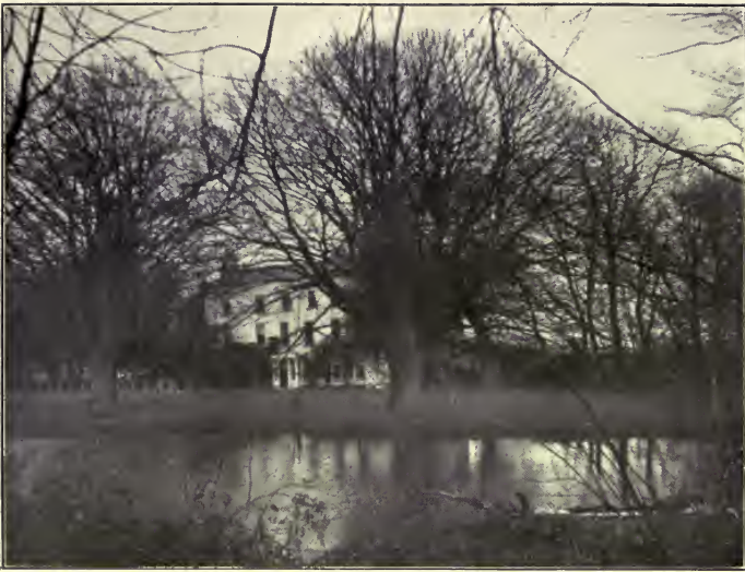
THE GRANGE, BALDOYLE